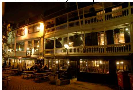
The George Inn Southwark

After the tour we strolled around the corner to the George Inn, Southwark. This is the only surviving example of an early coaching inn left in London and features in writings by Chaucer, Dickens and Trollope to name but a few. It may also be where William Shakespeare appeared, as the courtyard of the inn was used for theatrical performances at this time. It is now owned by the National Trust and run by Greene King Breweries who provided us with an excellent meal and plentiful wine, making a great end to a fascinating glimpse into the rich history of this part of London.