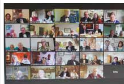
On-line Summer Dinner 2020