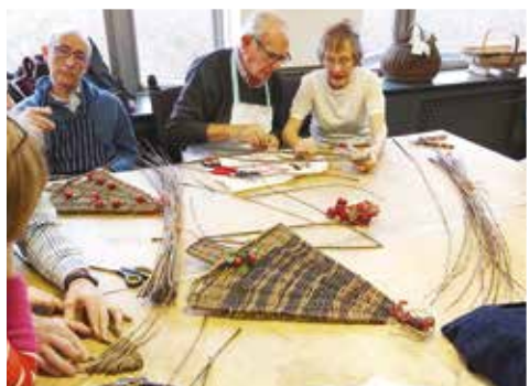
Family Basketmaking Day at on 24th November 2019