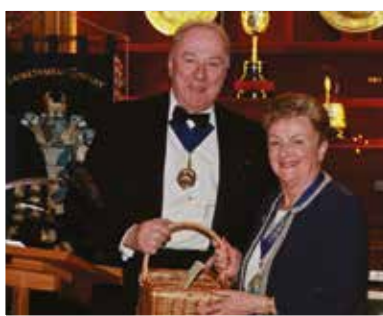
January Livery Dinner. The Prime Warden with Master Pattenmaker