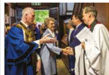
Thanksgiving Service at the Guild Church of St Margaret Pattens June 2019