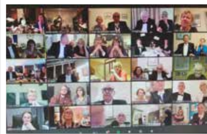
Our on-line Banquet 2020