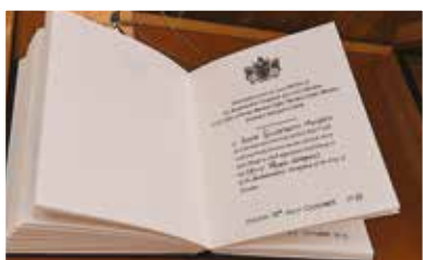
Signing of the Livery book