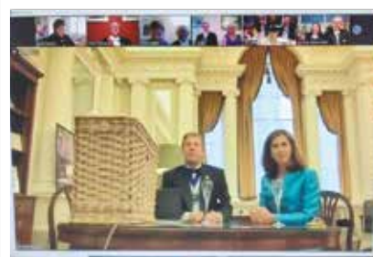
Lord Mayor and Lady Mayoress at the on-line Banquet 2020 with their new log basket made by Somerset Willow