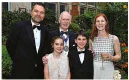
Basketmakers' Ball Drapers Hall, May 2019