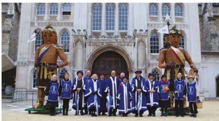
The Lord Mayor's Show with Gog and Magog outside Guildhall