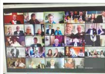
Our on-line Banquet 2020