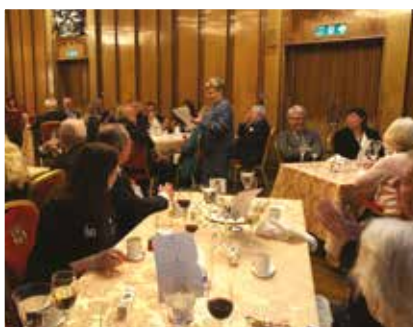
The supper after the Carol Service 2019