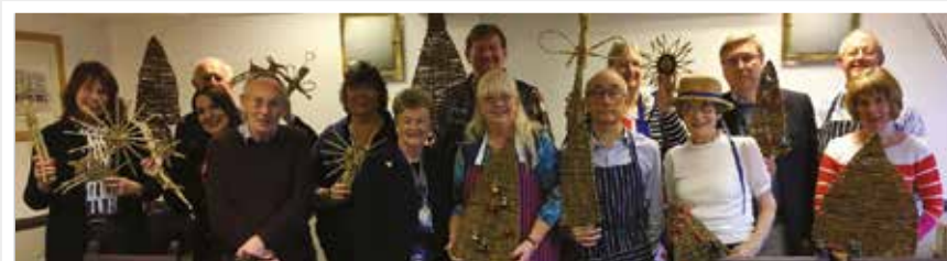
Basketmaking day 24th November 2019