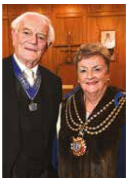
The Prime Warden and her Consort